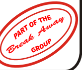
FIG: BAW X03 CL001